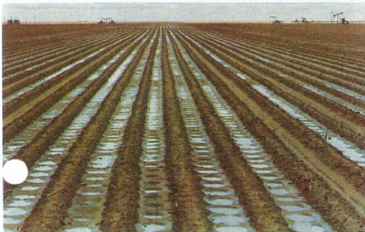
SOLID OR SKIP ROW

Route B / Lamesa, Texas 79331 (806) 872-8365