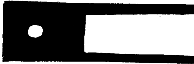
R660 771 LIFT ARM SHIM 3" x 10 1/4" SWAY BLOCK SHIM